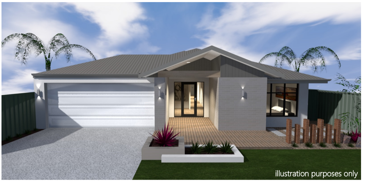
illustration purposes only