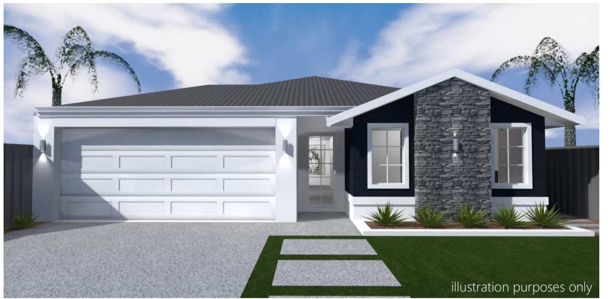
illustration purposes only