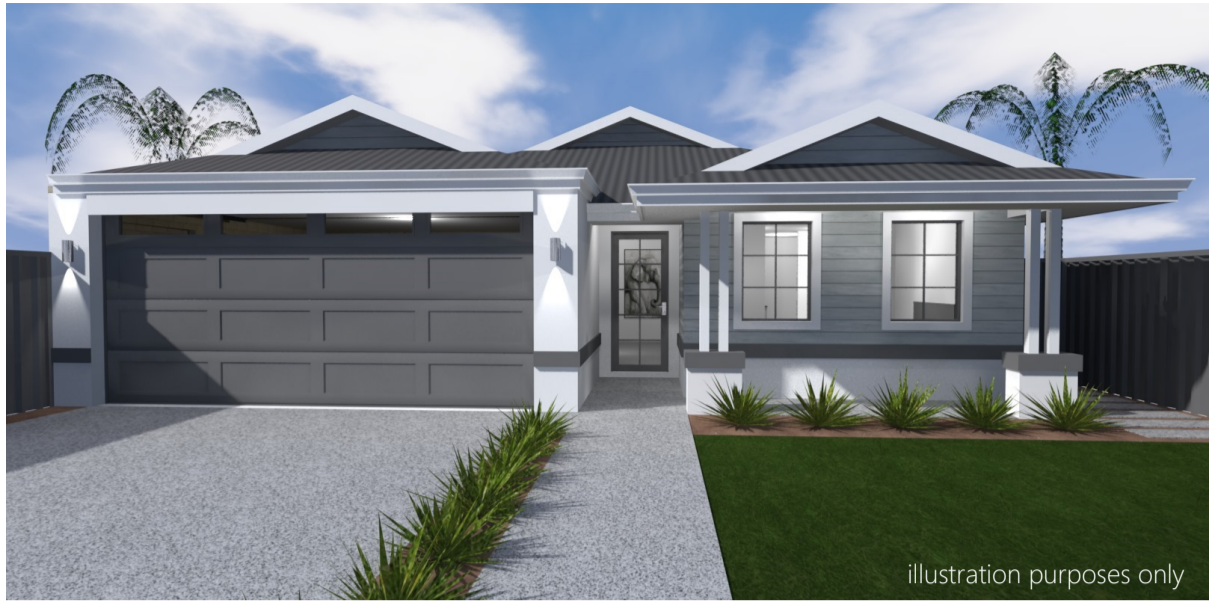
illustration purposes only